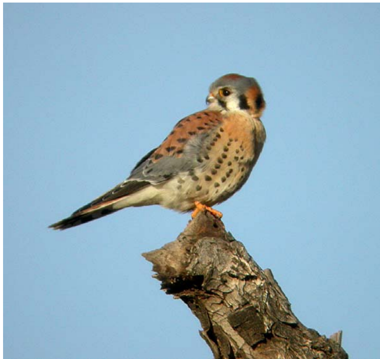
American Kestrel