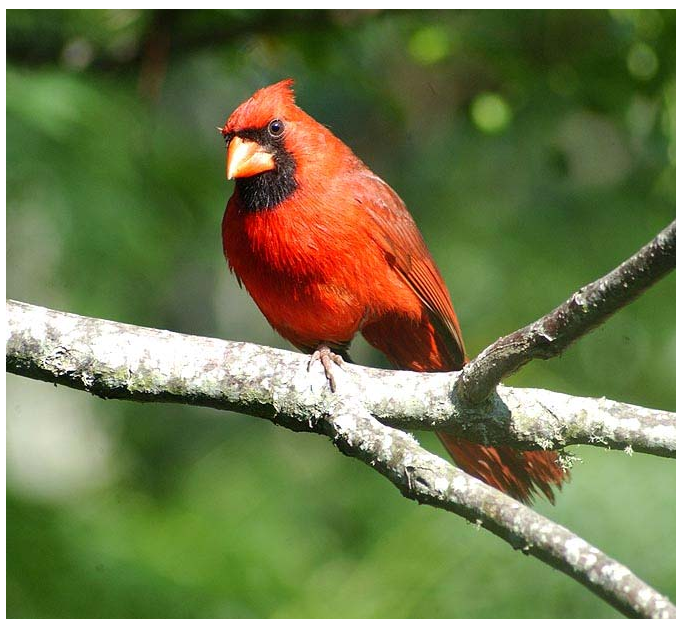
Northern Cardinal

Next we drove to the most reliable place for seeing Cactus Wrens – a corral with a windmill, stock tanks, and a couple of "junk piles." The Cactus Wrens like to hang out near the junk piles,