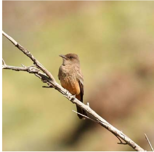
Say's Phoebe

We did well at Thompson Grove Park. A Blue Grosbeak was spotted first thing. A Common Night-hawk sat calmly in a tree above us with its body parallel to the branch it sat. We also saw an Ash-throated Flycatcher, Western Kingbirds and a Say's Phoebe.