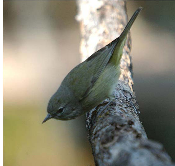
Orange-crowned Warbler