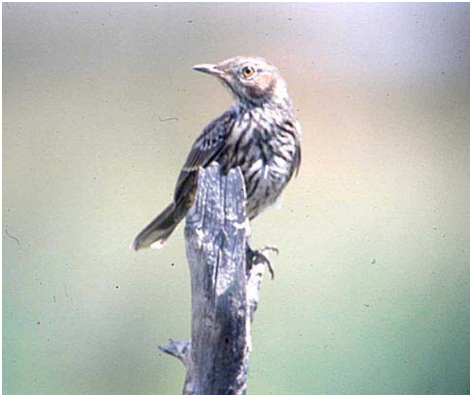
Sage Thrasher