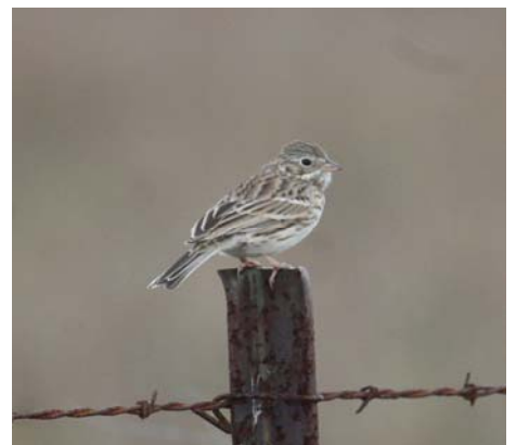
Vesper Sparrow