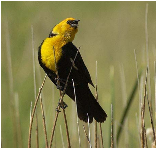
Yellow-headed Blackbird

From Tradewinds we drove to Southeast Park. It is difficult to walk behind the lake so we mainly birded the lake and the field north of the lake. We saw Double-crested Cormorant, Swainson's Hawk, American Kestrel and White-winged Dove. While there a flock of Yellow-headed Blackbirds thrilled us with a couple of brilliant aerial displays.