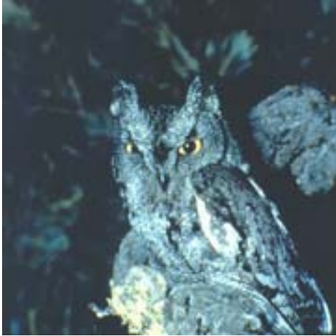
Western Screech Owl

leading to one of those “Oh man, we missed what?!” moments that can and do happen when birding in groups.)