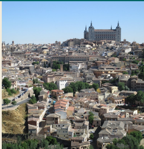
View of Toledo, Spain by Mariela Mendoza