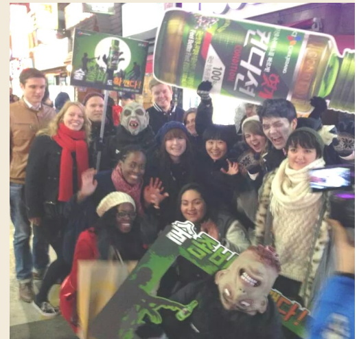
Making a commercial on our last night in Seoul!

“Looking back I realize that choosing to study abroad is one of the