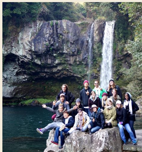
천지연 폭포 (Cheonjiyeon Falls /God's Pond)

Now I find myself wishing I was in Seoul. Wishing I could ride the subway to Hongdae one more time and walk the streets full of performers, go to my Korean class one more time and have my Korean language teacher call me by the nickname she assigned me 나쁜학생 (Bad Student). All these are happy memories now, and hopefully one day soon I will find myself back in Seoul.