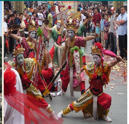
Festivities in Taiwan by Dava Eilert

SEND US YOUR STORIES AND PICTURES FROM ABROAD FOR A CHANCE TO BE FEATURED IN OUR NEXT ISSUE OF BUFFS ABROAD!