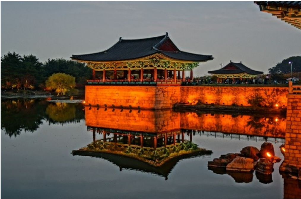
Anapji Pond, South Korea.