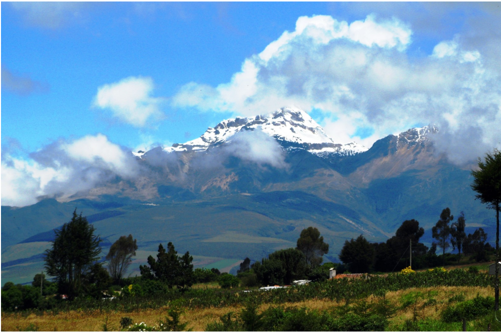
Cotopaxi Volcano, Province of Cotopaxi, Ecuador