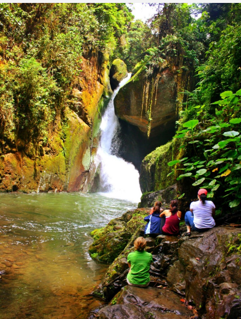
Costa Rican waterfalls.

Costa Rica has been home to 8% of buffs who decided to complete some Spanish credit abroad. The Costa Rican Language Academy located in San Jose is the most popular institution attended by students who are seeking to complete some Spanish credits. Students who are not seeking Spanish credit have studied at different universities, for example Universidad Latina in Heredia.