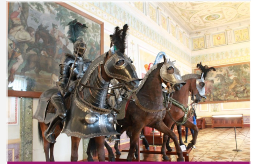
Hermitage Museum—exhibition inside

All the knowledge I had accumulated over the years on the