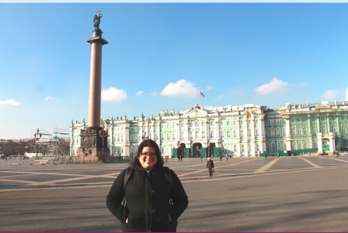
Hermitage Museum

I remember stepping into the Office of Study Abroad in the Spring of 2013 with the decision that I was going to go abroad. I didn't know where, but I knew I was going to go somewhere and it was going to be exciting. I often joke that I decided to travel to Ukraine by closing my eyes and pointing at the country on a large-scale map; however, it's not true. I had hardly ever heard of Ukraine at that point in my life, only hearing it in passing when mentioned in TV shows or movies.