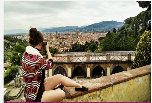
Photography in Italy.

30% of summer study abroad alumni have studied in Spain. Most of the buffs that have traveled to