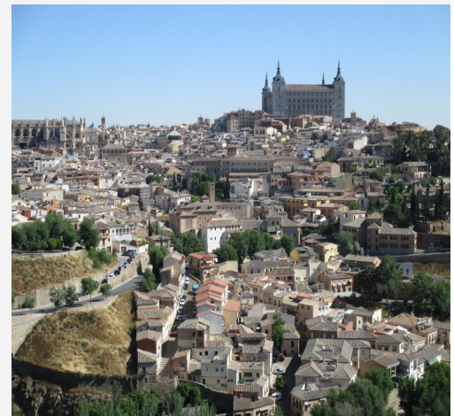
Toledo, Spain

The remaining 30% of students studied abroad in various countries including Turkey, China, South Korea, South Africa, Germany, Peru and France.