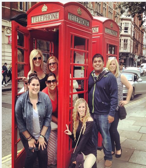
London phone booth.

The UK has seen 15% of our summer alumni, specifically England and Scotland. London is a very popular destination amongst theatre and communications majors, although, students across multiple disciplines including accounting and English have studied in London too. Meanwhile, Stirling and Edinburgh Scotland have hosted athletic training and nursing majors.