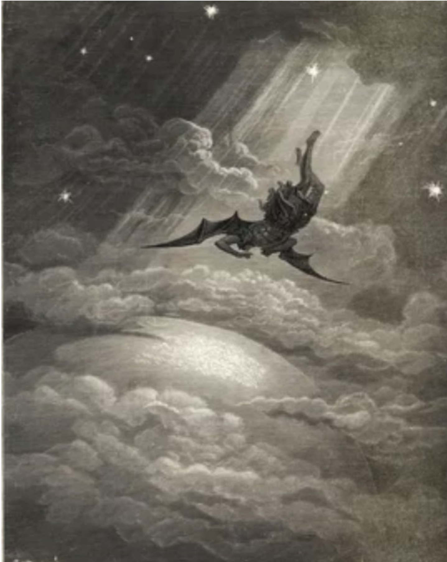
Doré, Gustave (1832-1883), The Fall of Satan . (1866), Engraving for Paradise Lost .

“A mind not to be changed by place or time. The mind is its own place, and in itself Can make a heav’n of hell, a hell of heav’n.” (1.232-234)