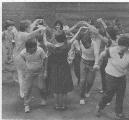
Kodaly Workshop, Summer 1985