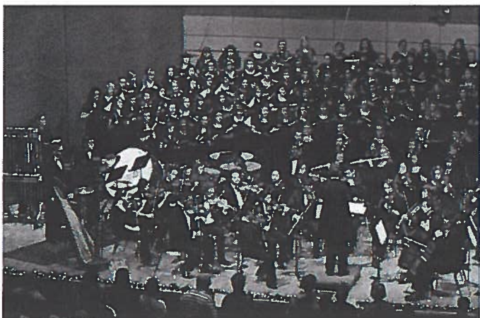
Orchestra Christmas Concert – Händel's Messiah