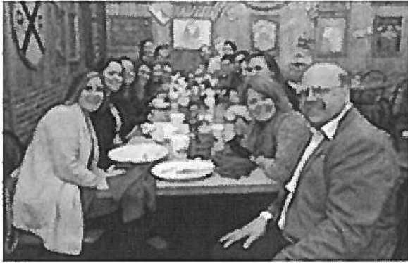
WT Students, Alumni, and Friends dining at SWAMTAS