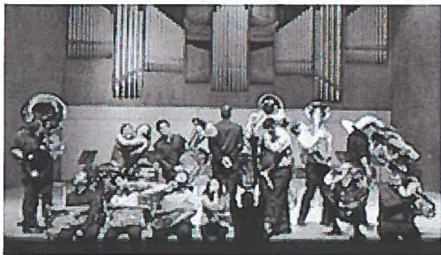
Tuba-Euphonium Studio having fun with the photographer