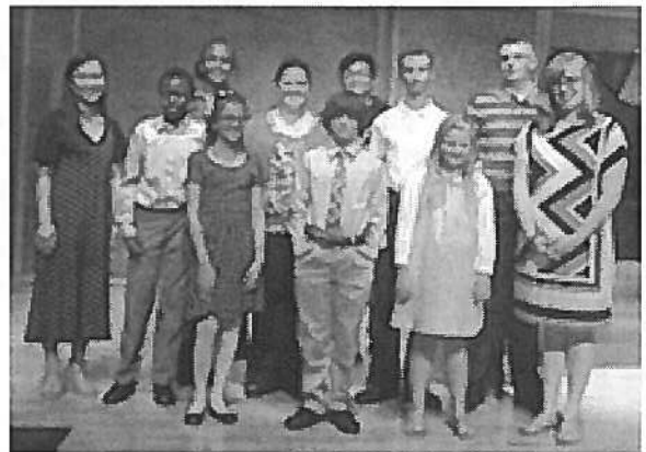
WT Academy spring recital students and teachers