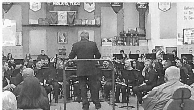
Symphonic Band on tour at Midland Lee High School