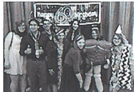
WT Music Therapy Students Celebrating SWAMTAS 60 th