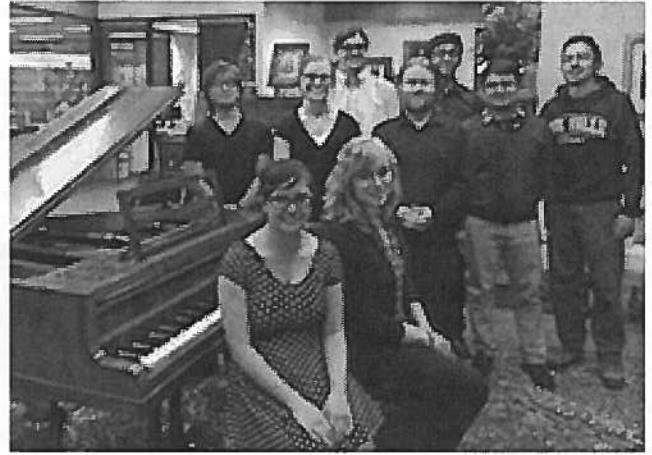
Final seminar in the Texas Poets' Corner - Cornette Library