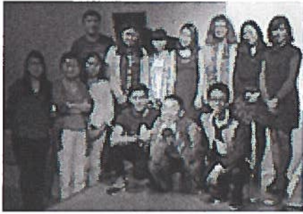
Master class at South China University, Guangzhou