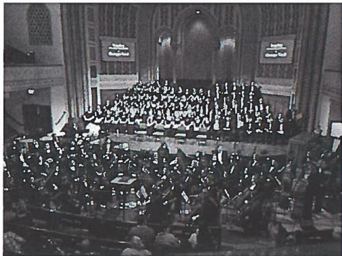
Verdi's Requiem at First Baptist Church in Amarillo