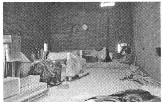
And now the other way.