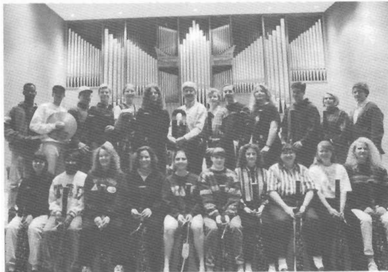
7th Annual Bassoon Bash Participants

Greetings from the choral music department. I thought I'd begin by giving you some information about our upcoming performances this year. The WT Chorale and Collegiate Chorus is joining forces with the ENMU choir and Amarillo Civic Chorus with several singers from this area in a concert performance of Beethoven's Fidelio . By the time you read this, it will be history. The concert is Saturday night, Oct. 21. Rehearsals are going well and the concert should be a rousing success. The concert has been sold out for three weeks! Our fall concert is in Northern Hall on October 26. The concert will include the Collegiate Chorus (34 voices) and the WT Chorale (43 voices) as well as three soloists and two duets from Chorale. Our annual Choir-Orchestra Christmas Concert is Friday night, December 1. Schola Cantorum will again participate in the Madrigal Dinner on December 2. The Chorale then sings for two civic Christmas programs prior to the holidays! The Spring