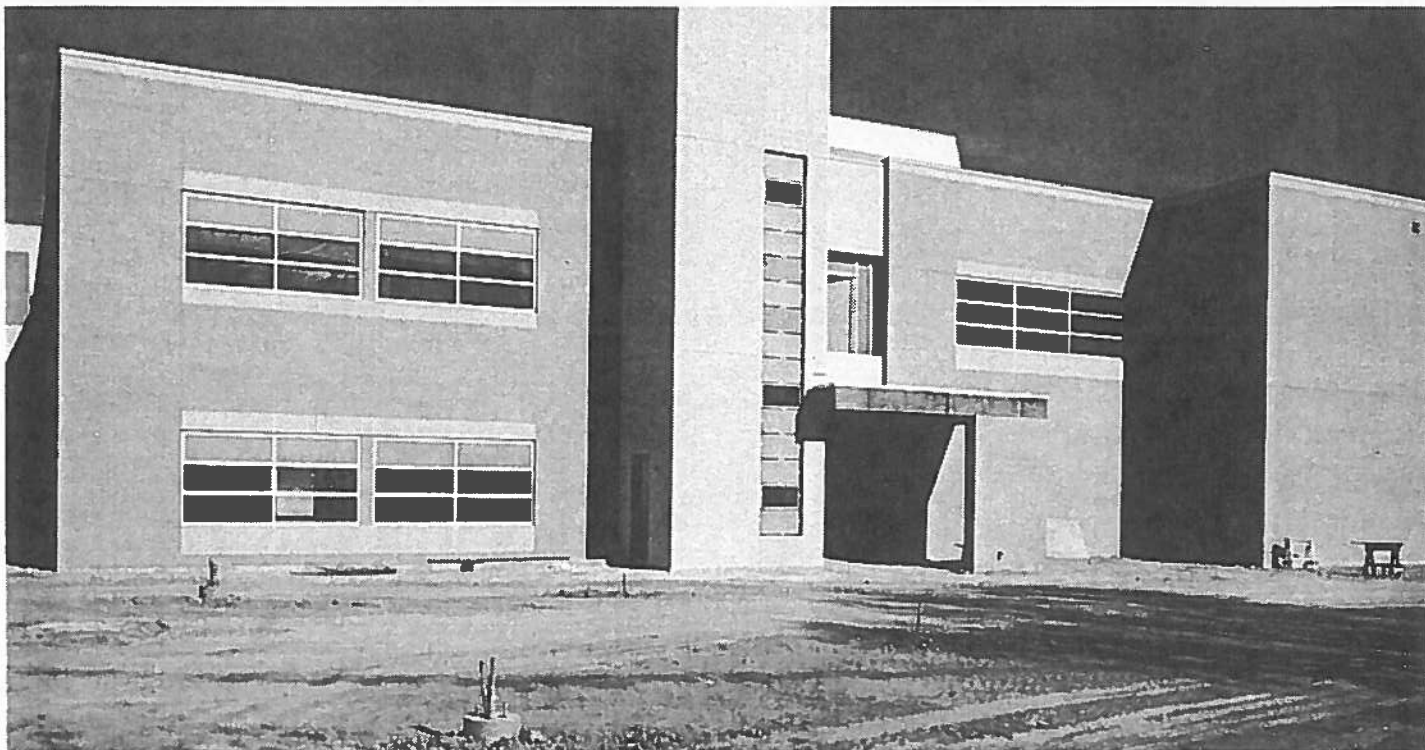
Southwest Entrance to the New Fine Arts Complex