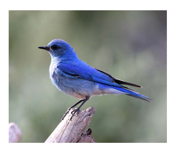
Western Bluebird Jim Stevenson

Golden Eagle: 3 - one in Moore County on Road 6, south of TX 281; one in Hutchinson County north of Stinnett; one in Randall County at Buffalo Lake NWR.