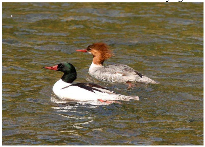
Common Mergansers Jim Stevenson

this time, I got lucky and spotted a male and female Downy Woodpecker and a single Ladder-backed Woodpecker. We then headed out to Plum Creek at Lake Meredith. When we arrived at the Plum Creek area of Lake Meredith, we parked our car near the boat ramp area at a spot where in times past we could look out over an expanse of lake-water with many ducks in it. However, this year, there was little lake and no ducks. Since it was so cold, we decided to have lunch in the warm car. We did though keep on birding. Candy spotted a bird that she had been anticipating all day - a Loggerhead Shrike. We then saw a Northern Harrier flying over