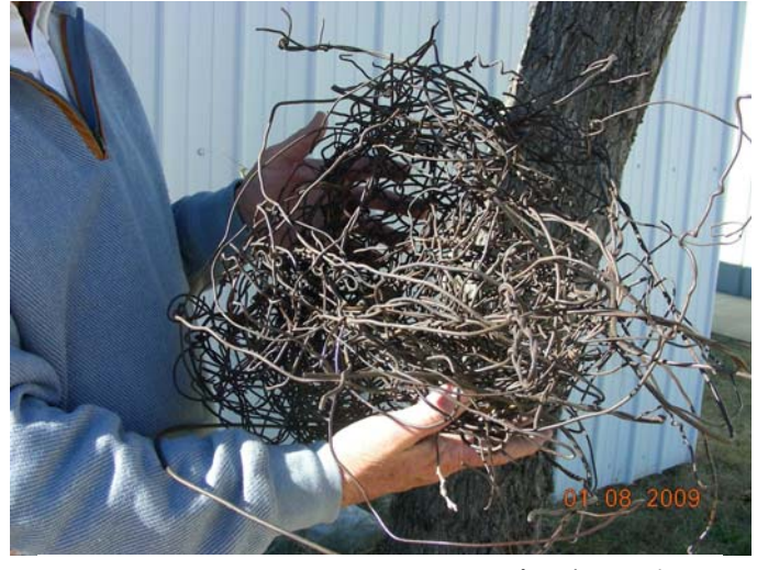
Happy New Year, Birders!

The nest was composed of many different strands of wire (at least 2 different kinds of barbed wire as well as various gauges of smooth wire). The longest strand appeared to be about 30 inches long. The wire nest weighed about 7 pounds.