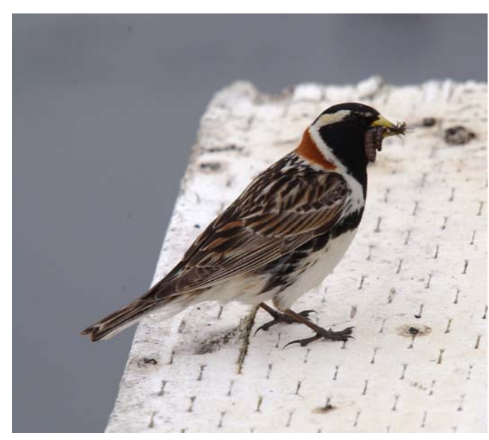
Lapland Longspur Jim Stevenson

Mountain Bluebird: ~100 birds total between two sightings: 25 birds in Hansford County in the Hansford Cemetery, which was very birdy; 75 birds in Randall County at Buffalo Lake NWR near the pay station.