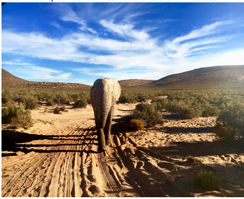
"THE MAJESTIC BEAST"

Determined by number of "likes" and "reactions" on Facebook.