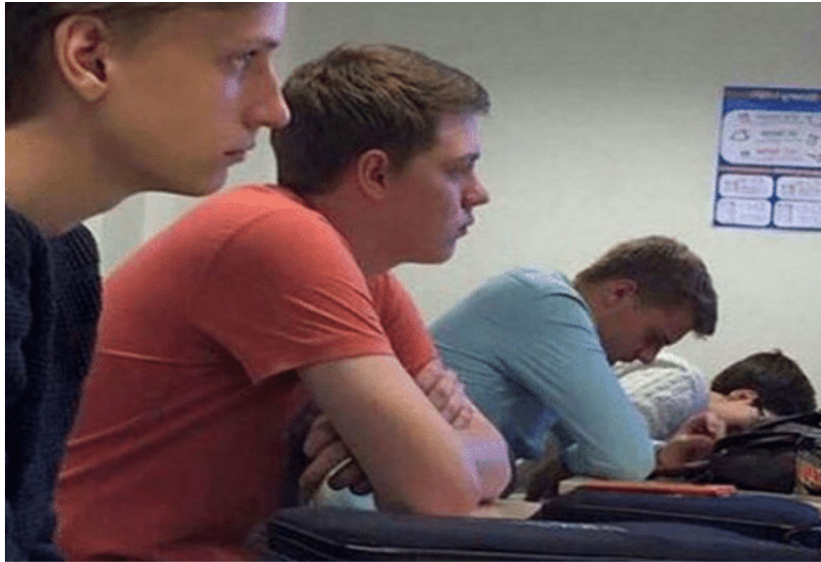
The 4 stages of a 9am lecture.