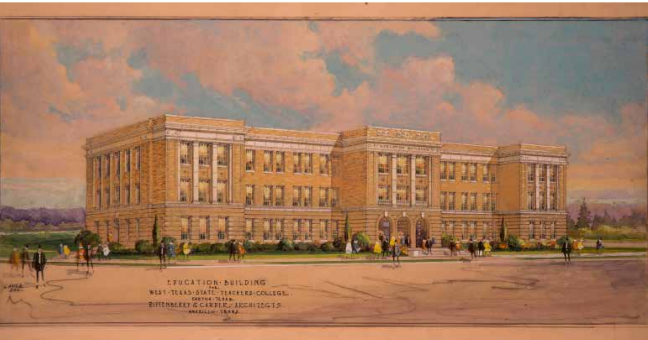
EDUCATION BUILDING WEST TEXAS STATE TEACHERS COLLEGE DENTON TEXAS BENSENKY & CARPER ARCHITECTS AMARILLO TEXAS