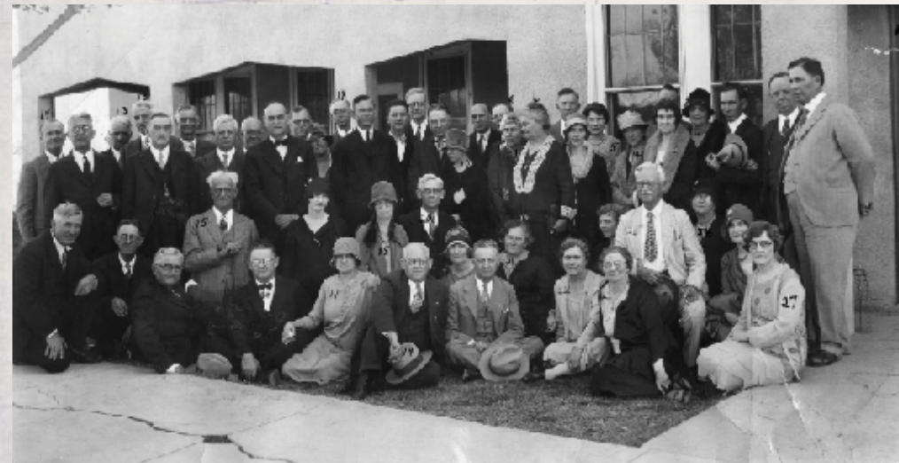
Citizens of Canyon and visitors at the dedication of the Education Building at the West Texas State Teachers College, in the fall of 1918.

Though it’s now used for storage, the Education Building could one day be the hub for WT’s ever-growing expansion into online education, connecting one of the campus’ most historic buildings to WT’s wide-open future.